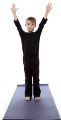
Joy Breath 1