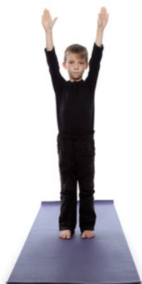
Joy Breath 5