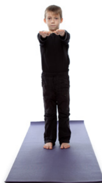
Joy Breath 4