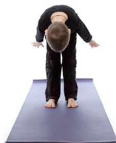
Joy Breath 6