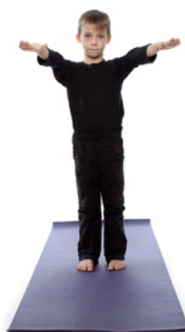
Joy Breath 2