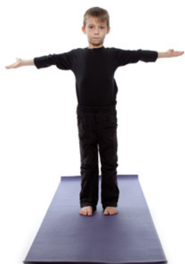
Joy Breath 3